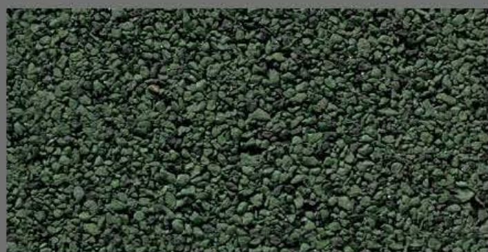
EMPIRE GREEN BLEND